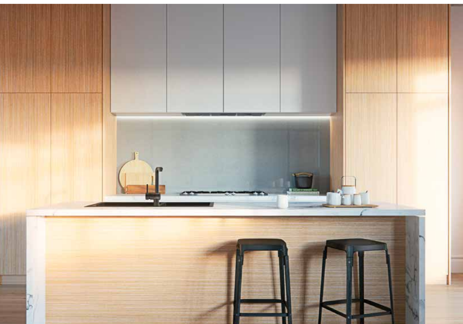
Germancraft Kitchens Top Splashback in Laminex Metaline Black Ice. Benchtop in Laminex Alfresco Compact Laminate Manganese. Bottom splashback in Laminex Metaline in Palladium Perle.