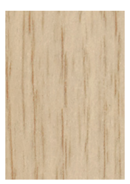
Cabinetry Natural Oak